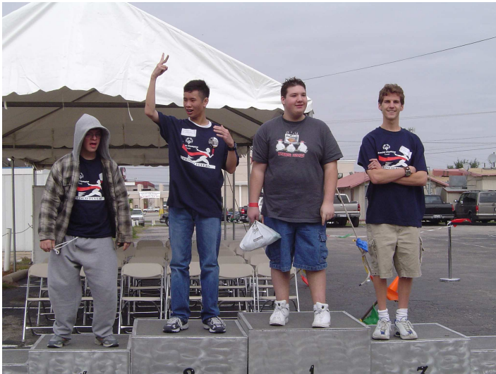
Three Frisco Flyers team members receive their awards.

The area bowling competition took place at USA Bowl in Dallas, at the end of October. The Frisco Flyers had 165 athletes compete throughout the week against other teams in the area. We had experienced bowlers and new bowlers competing in unified bowling, doubles bowling, and singles bowling. Everyone was a winner with tons of medals and ribbons won after all the athletes hard work practicing for two months.