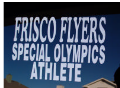
FSO Window Decals $5.00

SHOW YOUR FSO SPIRIT! MARK YOUR CALENDARS: