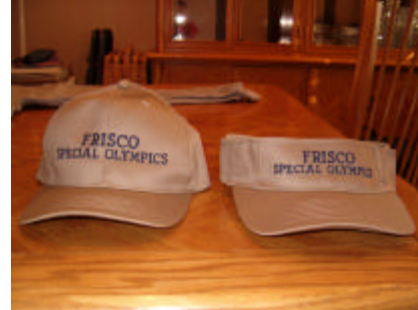
1 FSO Hat and 2 FSO Visors $5.00

We still have a few items available for purchase. If you are interested, please contact Julie Tollefson at 972-712-3093 or e-mail at tollytx@comcast.net .