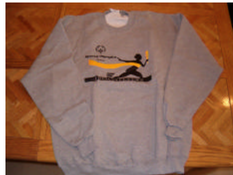
FSO Sweatshirts $12.00 Available Sizes: M, L & XL